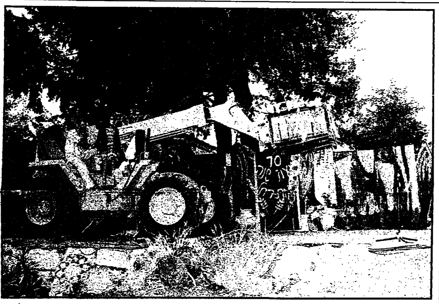
Fruitful festival Members of Kibbutz Ramat Rahel take part in a parade of the first fruits for the Shavuot festival yesterday. The kibbutz, established on JNF land 71 years ago, is located on the southern approaches to Jerusalem. (Joe Malcolm)

Palestinians, who claim east Jerusalem as a future capital, were highly critical of the legislation. "A resolution of obvious support for Israel... puts a big nail in the coffin of the peace process and the credibility of the United States as a peace broker," PA Higher Education Minister Hanan Ashrawi said yesterday. Most countries in the world, including the US, have not recognized Israel's annexation of east Jerusalem immediately after the Six Day War. It has been the position of successive US governments that the city must never be divided again, but that its future must be settled through negotiations.